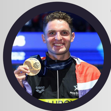
Lewis Clareburt World Champion Swimmer