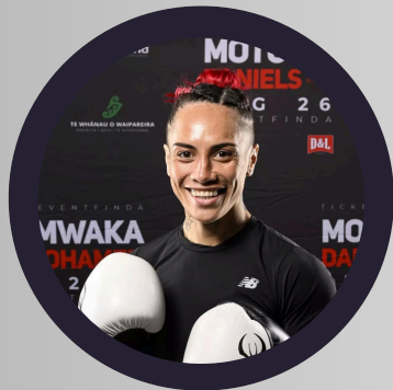
Mea Motu World Champion Boxer